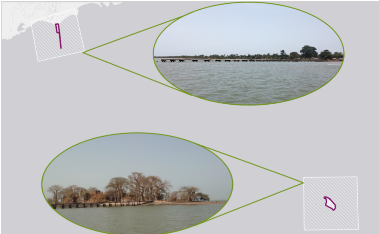
Figure 3: Location 2- Kunta Kinteh Island and Albreda jetty