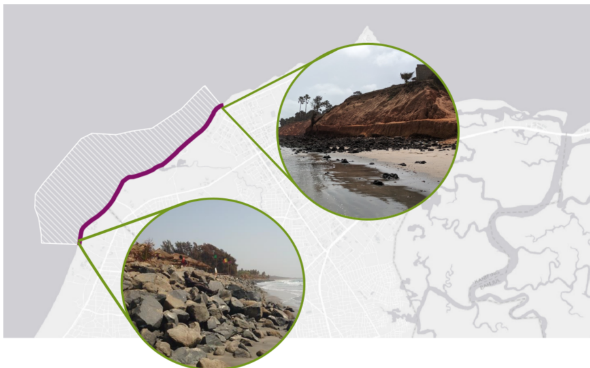
Figure 2: Location 1- West Coast Beaches from Senegambia to Fajara