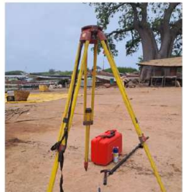
Visits to Kartong, Tumani Tenda and Foni Berefet