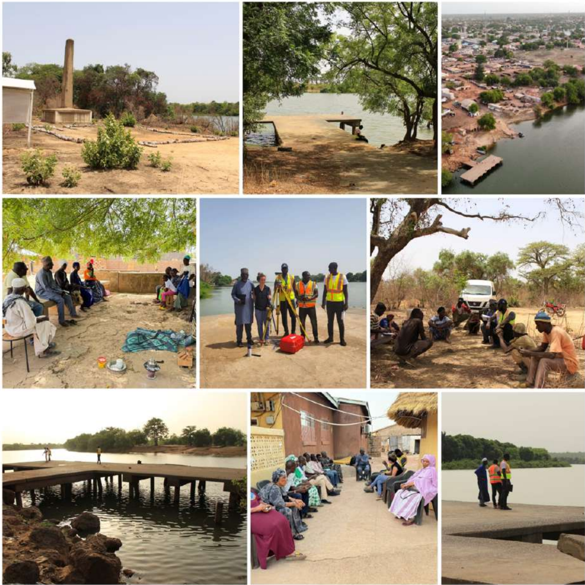
Visits to Bansang, Mungo Park (Karantaba Toro), Karantaba (Tenda) & Basse